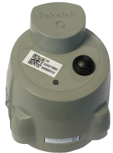
2" extended threaded mounting adaptor – Standard