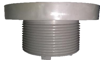
Multi Thread Adaptor Kit (1 1/4", 1 1/2", 2") [Sold Separately]